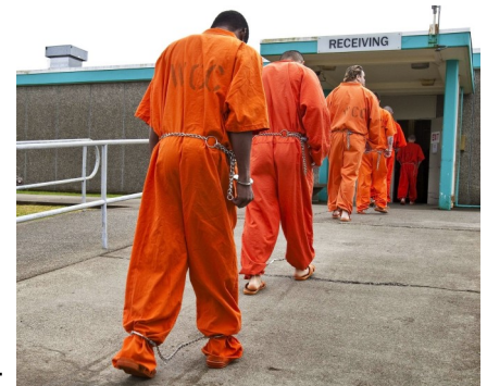
Walla Walla Penitentiary prisoners are allowed to listen to KLRF. Your gifts guarantee this life-changing message will continue to be available to all wherever they may be.

You share in prison ministry by supporting KLRF. Your gifts will ensure that inmates are able to continue listening without interruption.